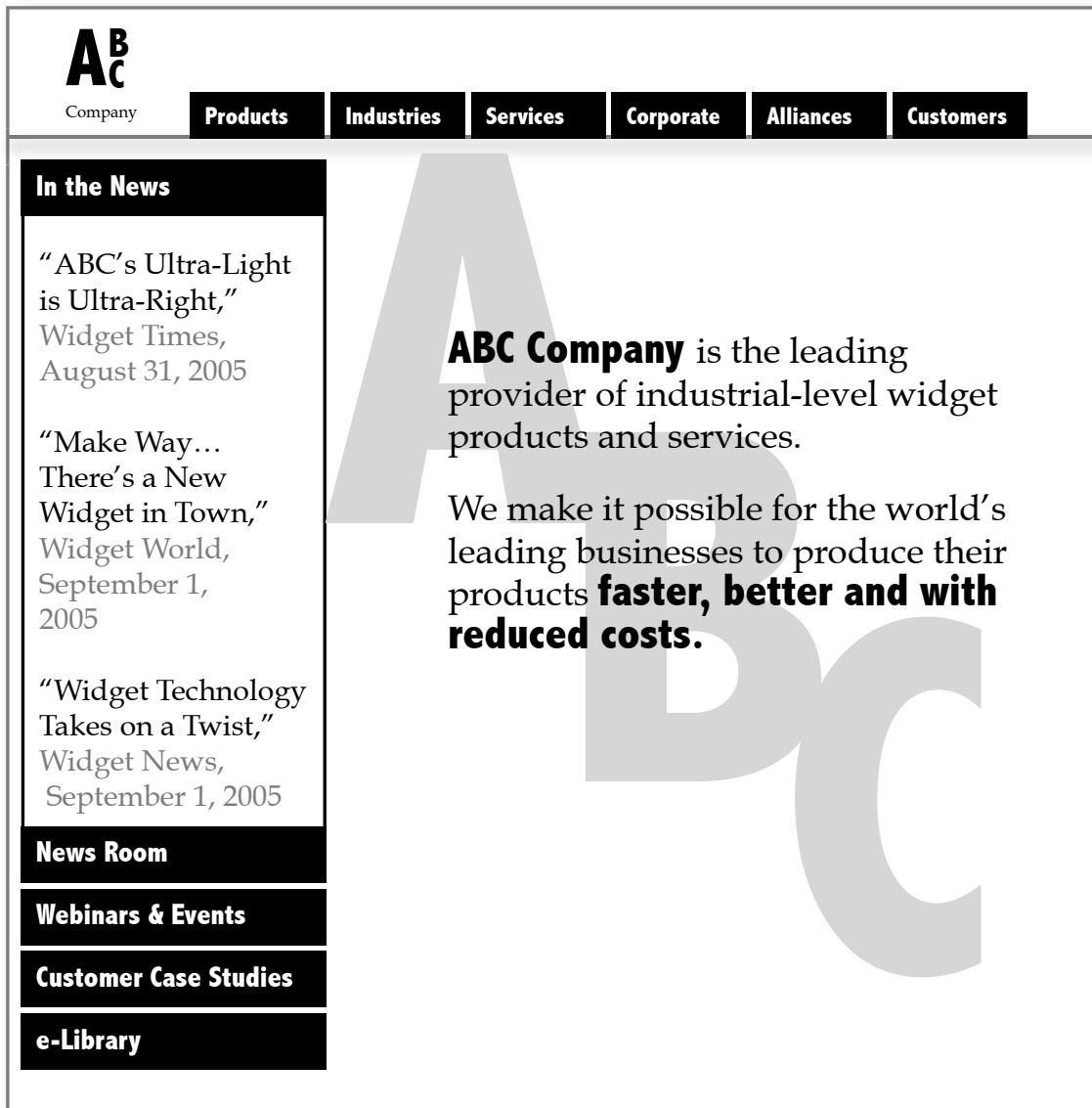
Example 11.1: ABC Company Homepage